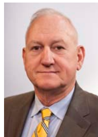
Tony Perkins President, FRC

A handwritten signature in black ink that reads "William G. Boykin".