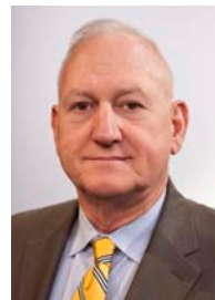
Tony Perkins President, FRC

A handwritten signature in black ink that reads "William G. Boykin".