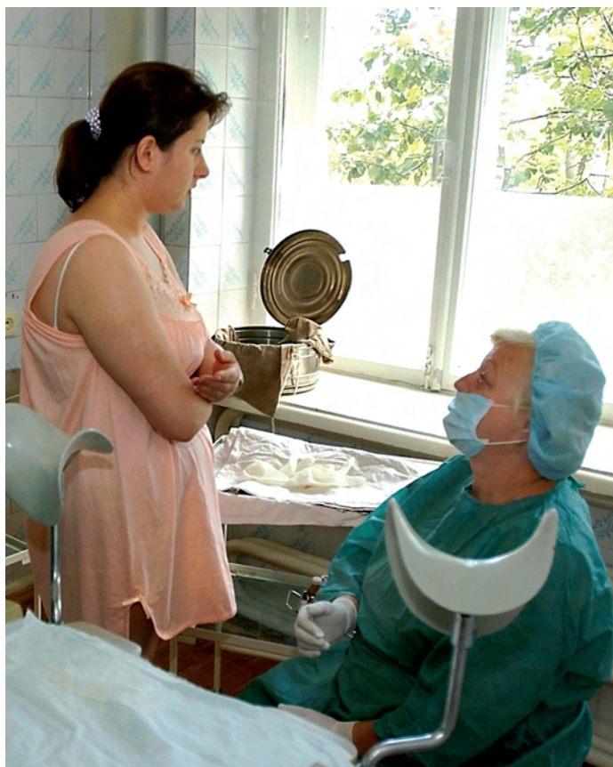
An abortion doctor talks to an unidentified 27-year-old woman before she undergoes an abortion.

Distinguished Professor of OB/GYN at University of North Carolina Medical School, was lead author of a large review article that included all large, long-term studies of abortion in English through 2002. The authors concluded that abortion is associated with depression serious enough to cause risk of self-harm and that women should be warned in the informed-consent process.