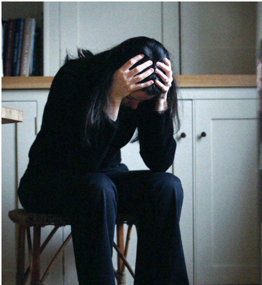
Medical and scientific studies and personal stories reveal that abortion is a life-changing experience that causes many women to suffer psychologically.

The effect on the babies to be aborted is obvious, but little attention is paid to how increasing abortions will affect women.